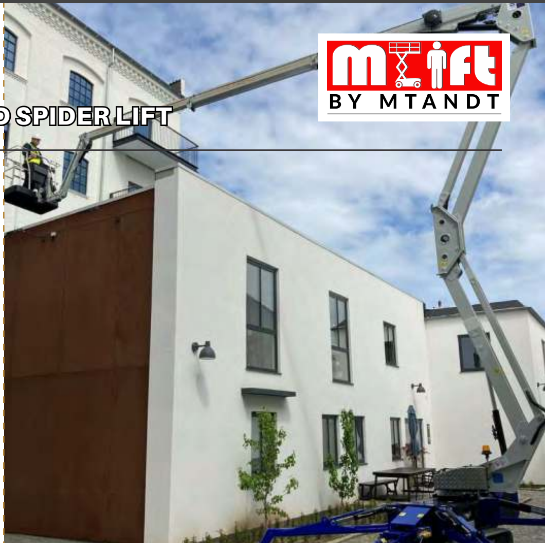
Falcon 230Z (Falcon 76Z)