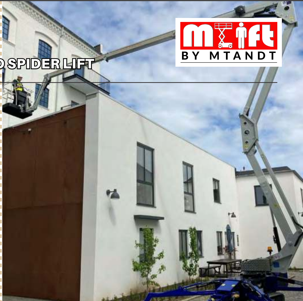
Falcon 270Z (Falcon 88Z)