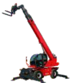
Forklifts & Telehandlers