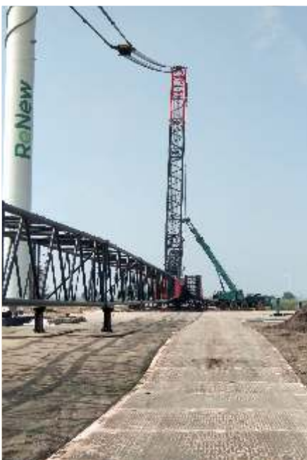
Extension roads for boom erection