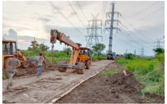
Roads to reach towers sites