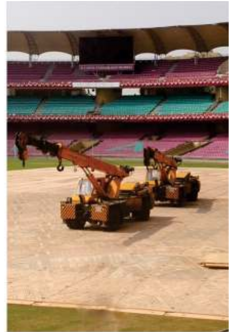
Turf Protection for Events