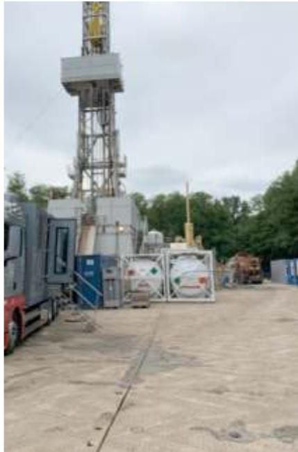
Oil & Gas Drilling