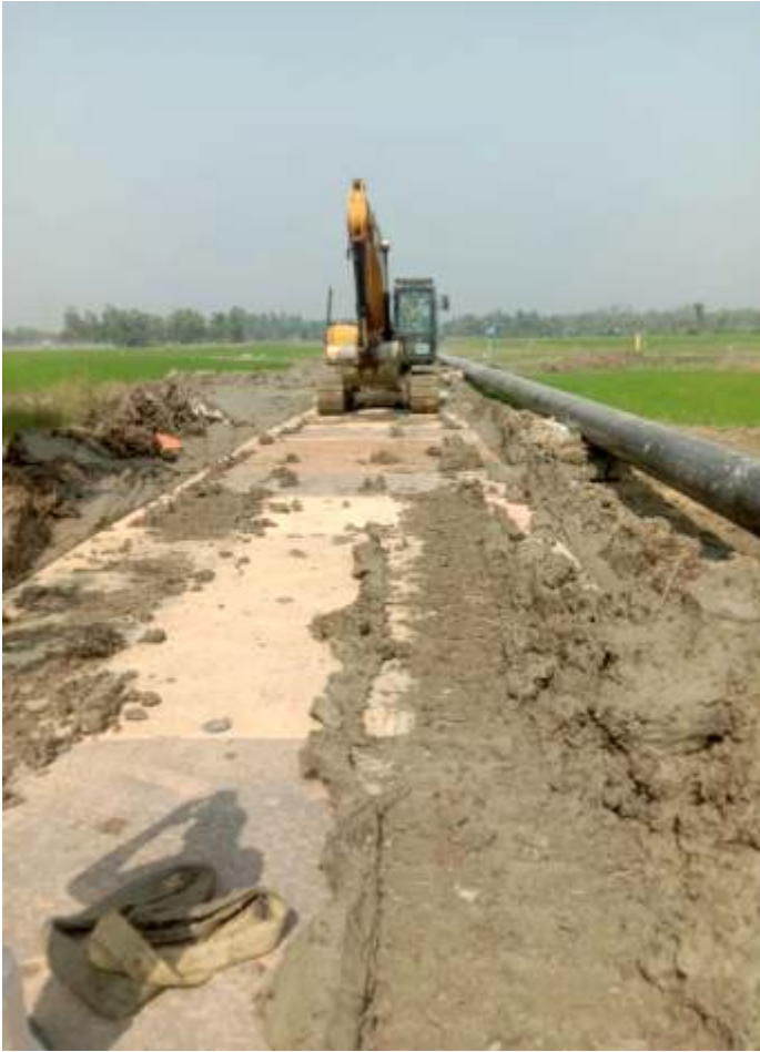
Roads to reach & work on ROW