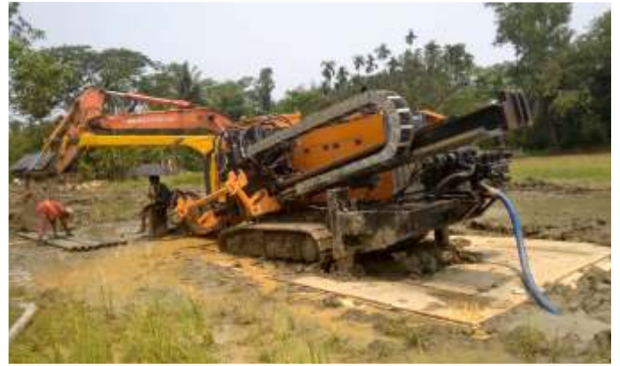
Platforms for HDD