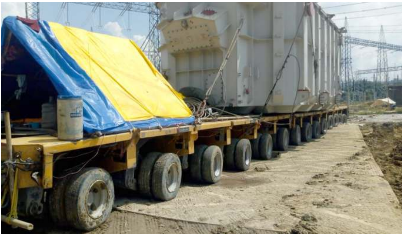
ODC cargo (transformers) and heavy equipment movement at substations