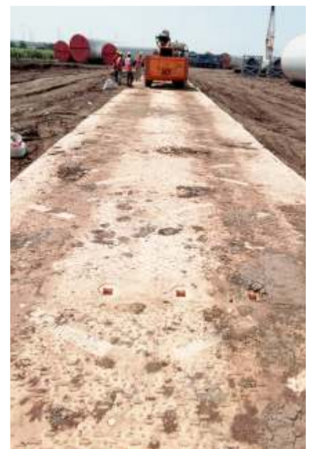
Roads within storage yards