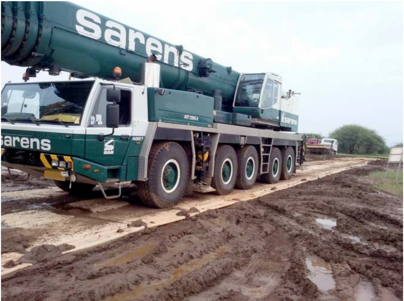
Heavy equipment movement for wind turbine erection