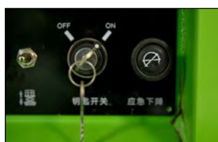
Emergency Descend Valve